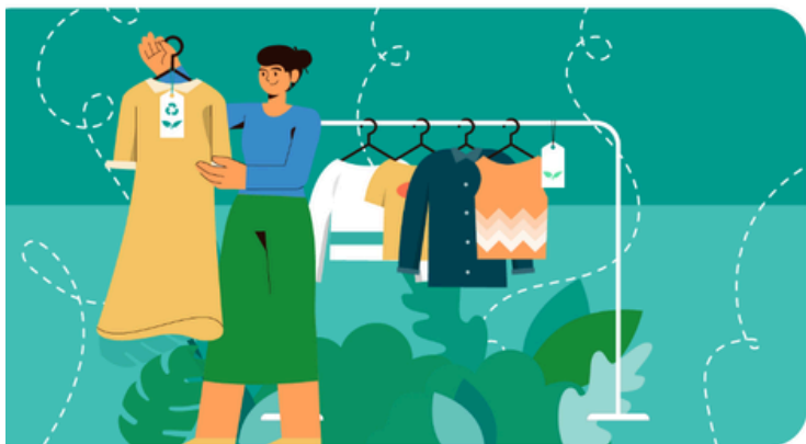
Bio-Textile Technician Course (EQF 5)

To support this, a dedicated platform has been created. By creating a profile, you can join both national and international groups, connect with peers, exchange knowledge, and expand your professional network.