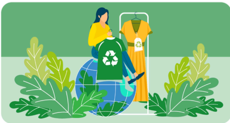
Textile Recycling Manager Course (EQF 6)